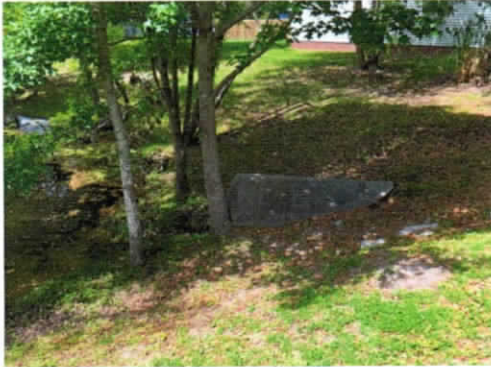
Trees at inlets