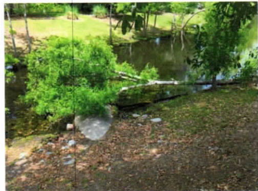
trees blocking inlets/ refresh rip rap