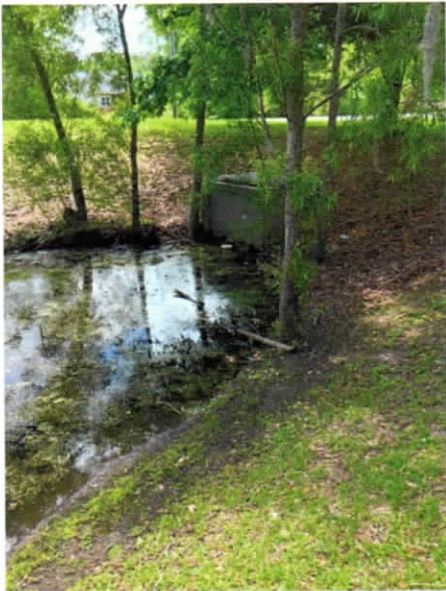
Debris blocking outfall structure