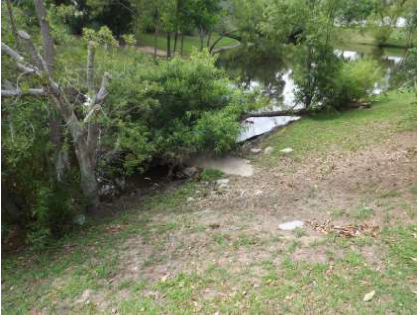
Trees around inflow