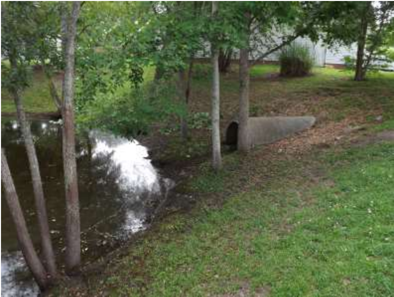
trees around inflow