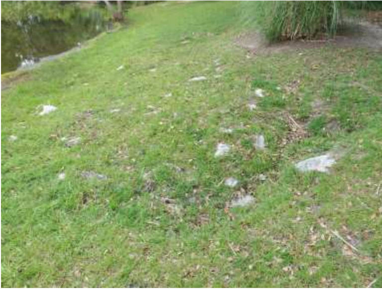
rip-rap to refresh