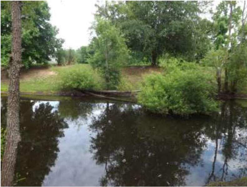
fallen tree at inflow