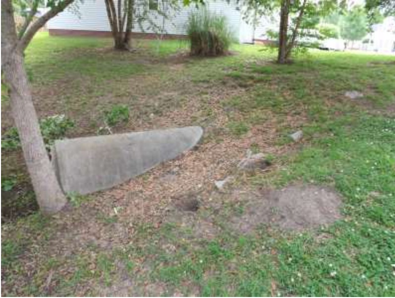
rip-rap to refresh