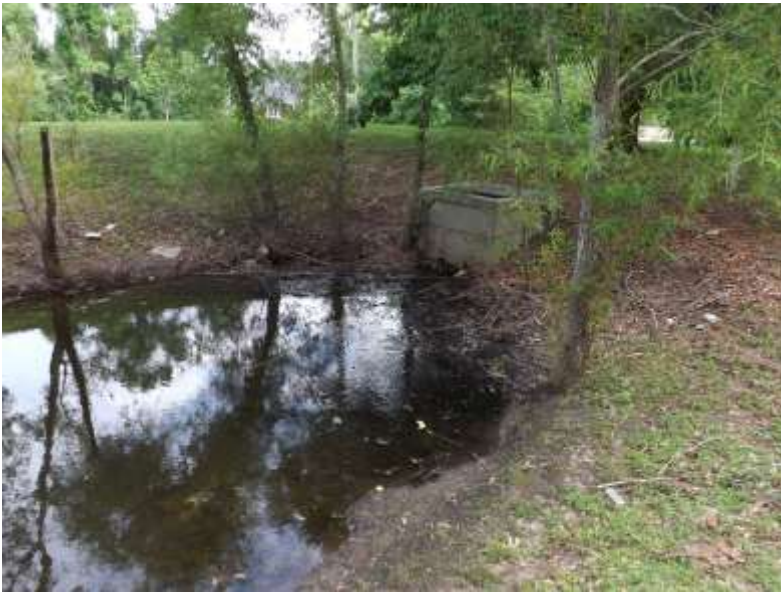
outfall with minor debris